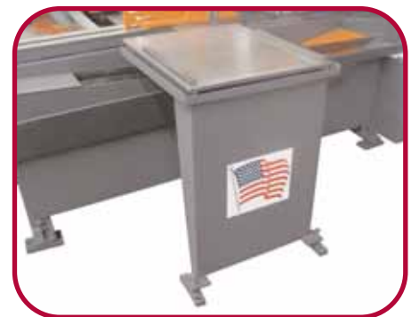
24" Solid Discharge Table Standard