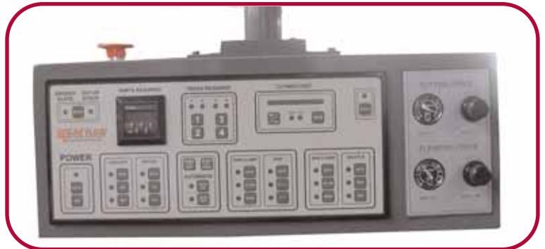
Console - Easy View Console