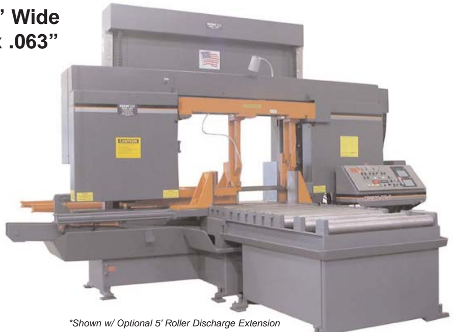
*Shown w/ Optional 5' Roller Discharge Extension

Swing-Away Console - All Function Control Solid State Programmable Logic Controller Full Stroking Vises Guide Cap Camlocks Push Button Blade Speed w/ LED Readout Blade Chip Brush Powered Moveable Guide Arm Arm Height Adjustment From the Console Chip Auger System Automatic Shut Off Powered Blade Tension Cut Watcher System Electronically Controlled Traverse (ECT) Controls Feed Rate & Cutting Force Computer Controlled Feed System (CCF) Material Jogging Feature Flood Coolant System 24" Roller Discharge Table 3rd Vise on Feed 0 - 24" Stroke Bar-Feed