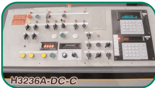
*Shown w/ Optional HCCT Screen