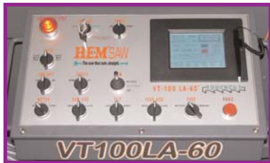
Console Pivots from Front to Right Side of Saw

Arm Cant: 3° - Arm Can Be Adjusted to Straight Cut Position