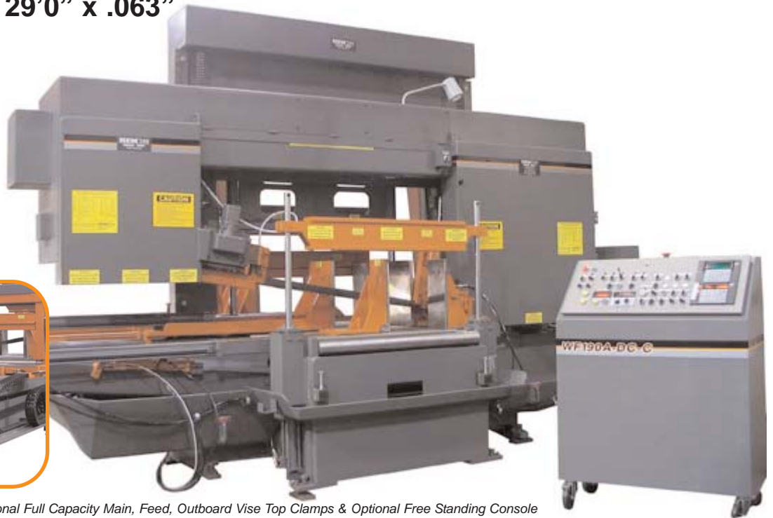
*Shown w/ Optional Full Capacity Main, Feed, Outboard Vise Top Clamps & Optional Free Standing Console